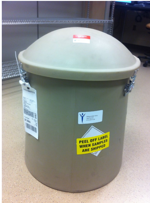
Figure 1: Red Kit (LN2 dry vapor shipper)